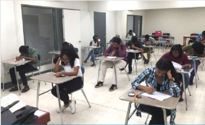
Pre COVID Exams in February