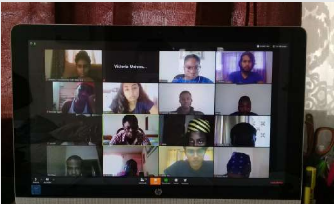
VUB on line in the mist of a pandemic.